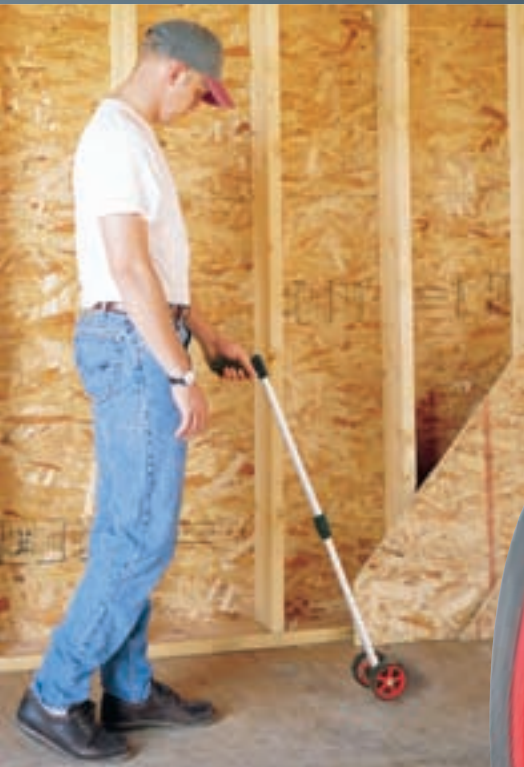
Series 18 Dual