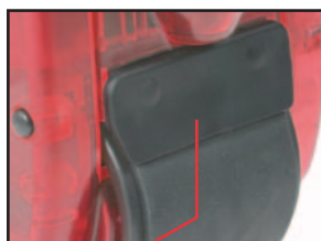
Built-In Wheel Scraper